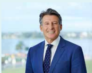
Lord Sebastian Coe CH, KBE

Chief Executive Officer/ Managing Director