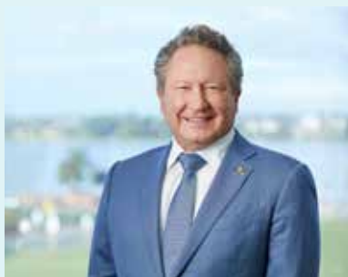
Dr Andrew Forrest AO

Fortescue has a talented and diverse Board committed to enhancing and protecting the interests of shareholders and other stakeholders and fulfilling a strong governance role